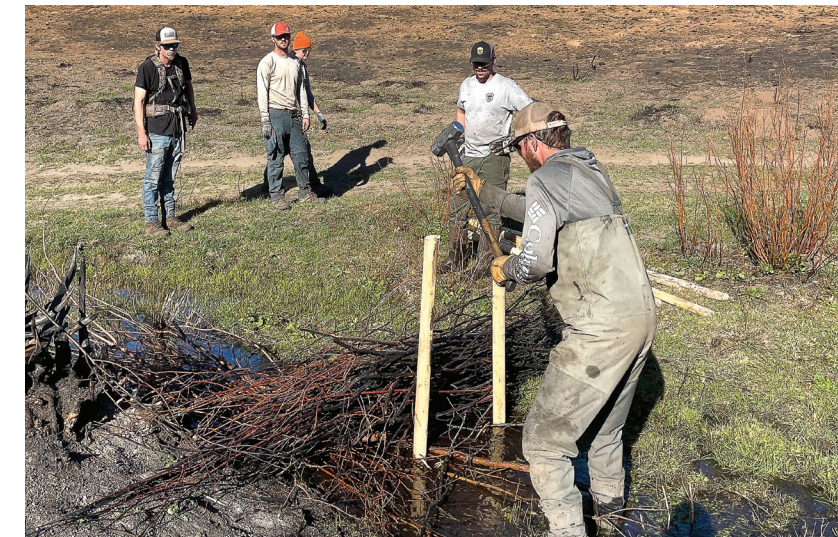
Staff and volunteers carrying out post-fire recovery at Rinker Rock Creek Ranch.

With Rinker Rock Creek Ranch serving as a research hub, we have a unique opportunity to monitor the ecosystem’s recovery. Early signs of regeneration are already visible, and researchers will continue tracking wildlife, such as sage grouse, to assess the recovery. We’re incredibly grateful to the University of Idaho for their ongoing stewardship and to our volunteers and donors for their commitment to restoring and protecting these critical landscapes. A heartfelt thank you to everyone who contributed to this vital recovery effort!