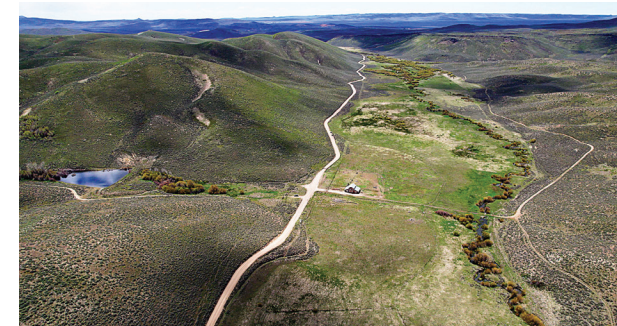
Aerial view of the 10,000+ acre Rinker Rock Creek Ranch, located west of Hailey.

Beyond large-scale restoration, individuals can also make a difference at home. This fall and winter, we’re working with partner environmental non-profits, private businesses, individual homeowners and associations, and local government partners to revamp our Trout Friendly Yard Certification. This certification informs community members how you can get involved in improving water quality, conserving water, and mitigating the risks of natural hazards in your backyard.